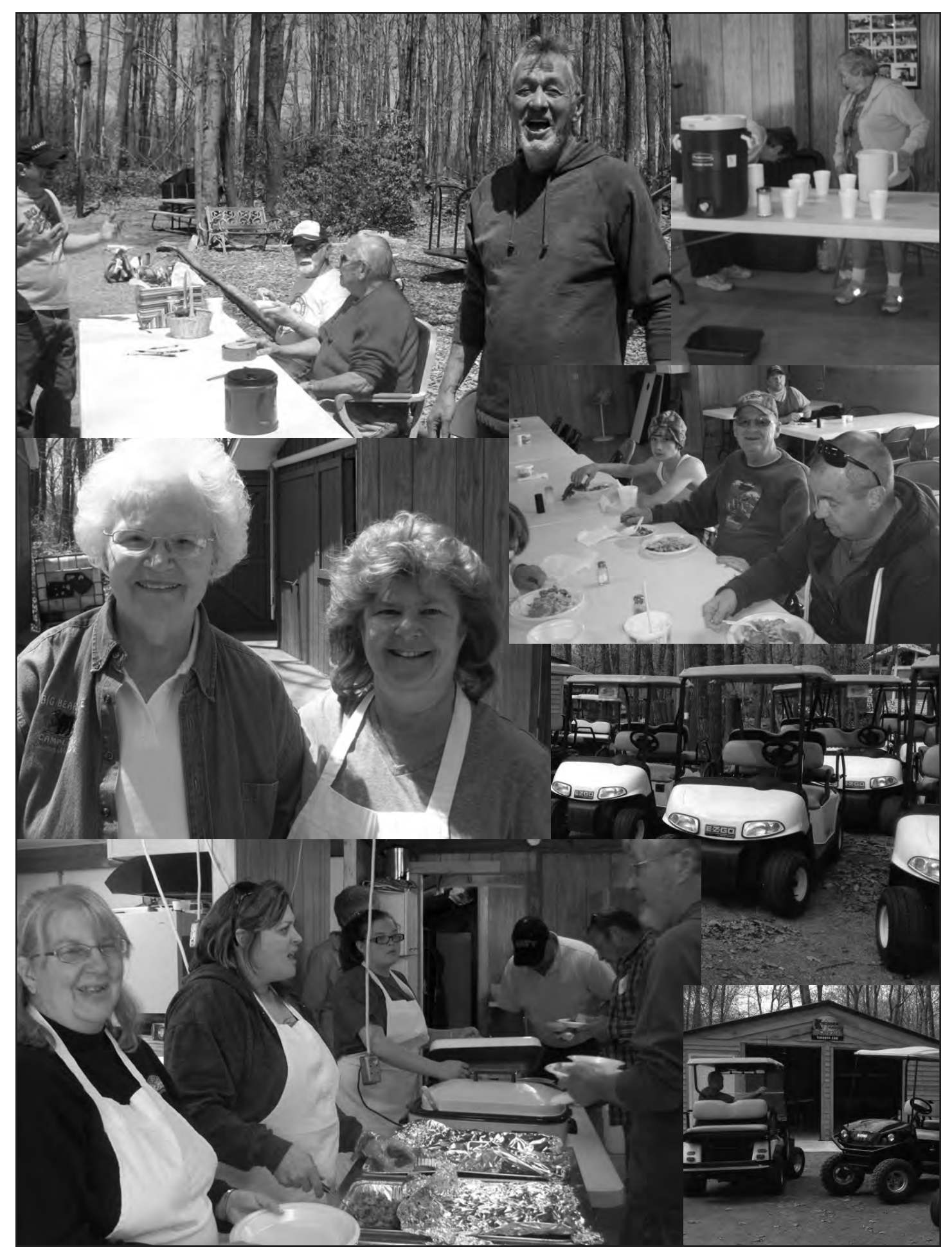
Page 11, Summer Edition 2013